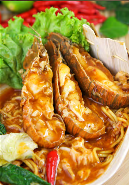
CHILI CRAYFISH MEE