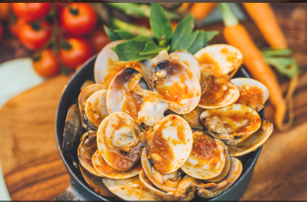
HOT CHILI BASIL CLAMS