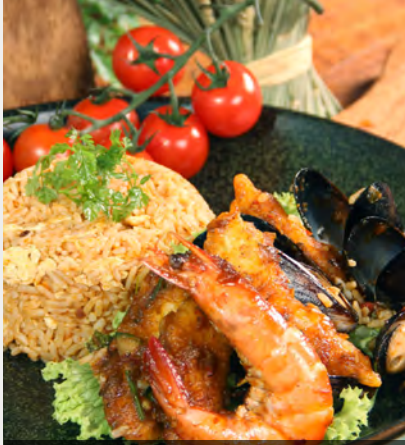
NASI GORENG SEAFOOD TIGA RASA