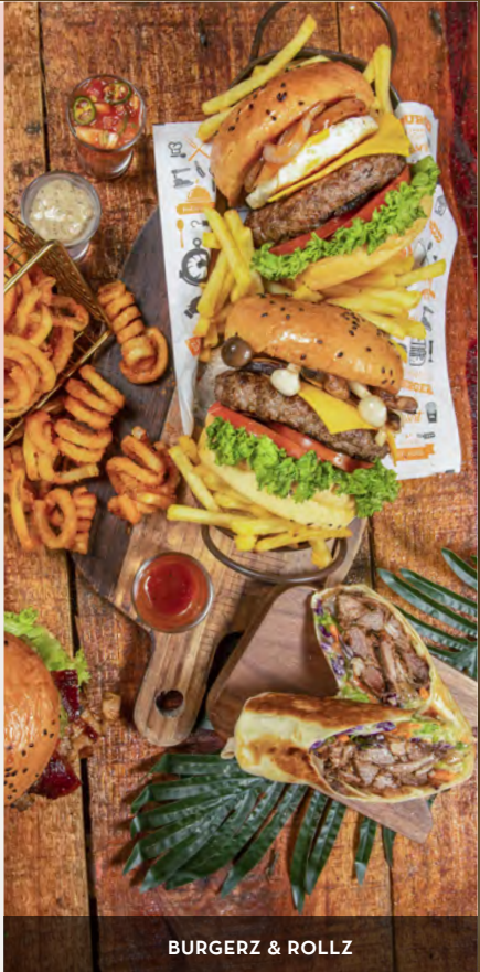
BURGERZ & ROLLZ