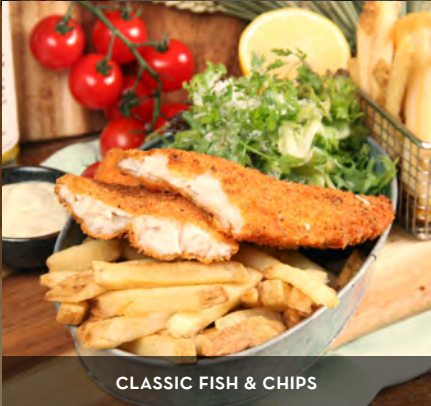
CLASSIC FISH & CHIPS