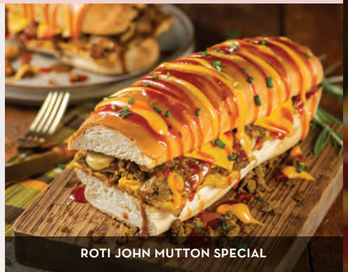
ROTI JOHN MUTTON SPECIAL