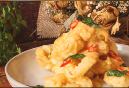
CRISPY SQUID & SALTED EGG