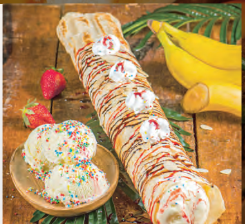
BANANA ICE CREAM TISSUE

SPECIALTY PRATA, MURTABAK & DESSERT PRATA WILL BE AVAILABLE FROM 4PM ONWARDS.