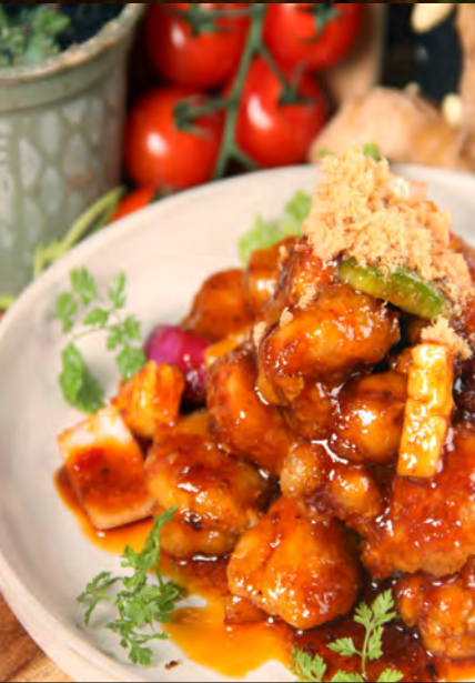
SWEET FRIED CHICKEN