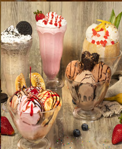
MILKSHAKES & SUNDAES