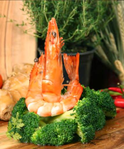
STIR FRIED BROCCOLI W TIGER PRAWNS