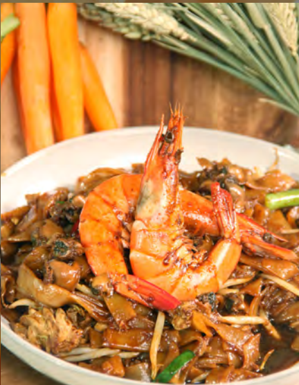
PENANG CHAR KWAY TEOW