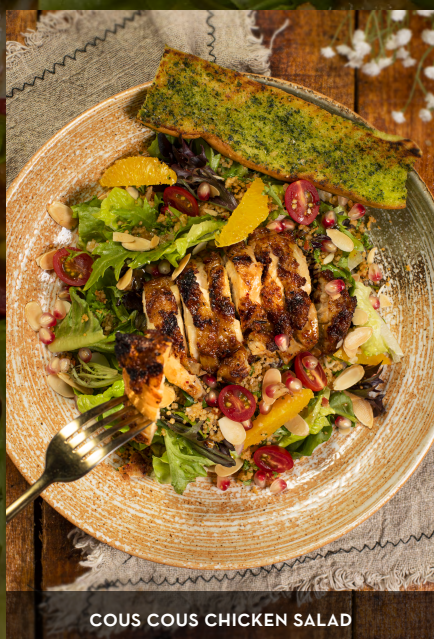
COUS COUS CHICKEN SALAD