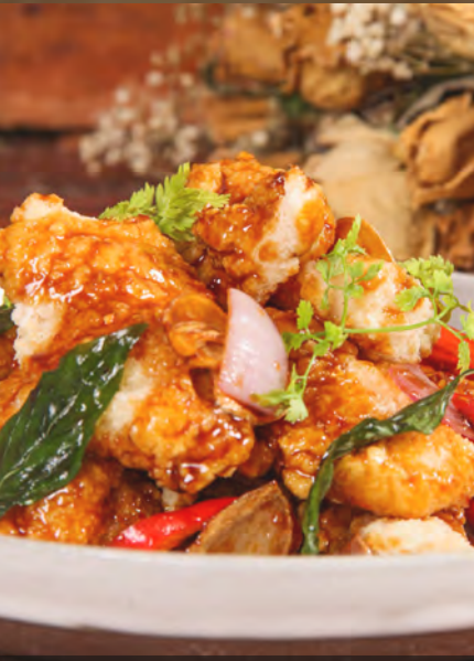
KAM HEONG & CURRY LEAVES SLICED FISH