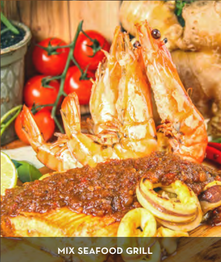
MIX SEAFOOD GRILL