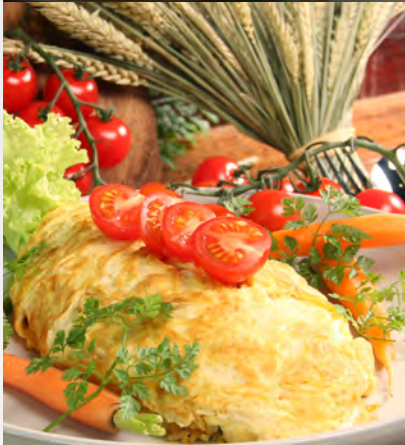
NASI GORENG PATTAYA