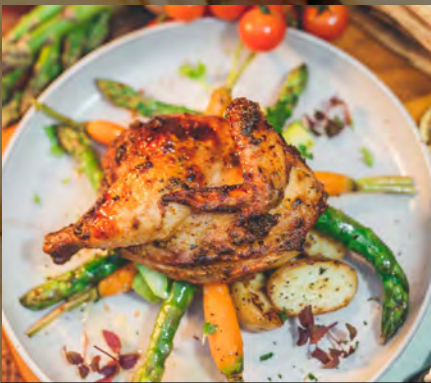
MOROCCAN ROAST CHICKEN