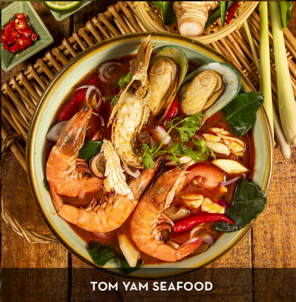
TOM YAM SEAFOOD