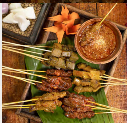
CHARCOAL GRILLED SATAY