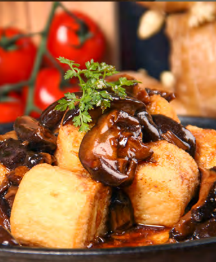
HOTPLATE EGG TOFU W FRESH MUSHROOMS