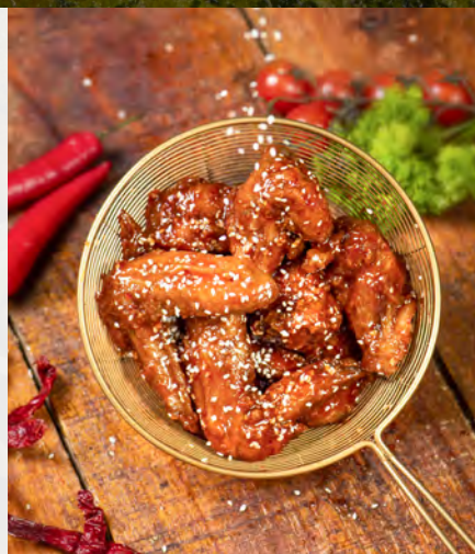
SRIRACHA & HONEY GLAZED CHICKEN WINGS