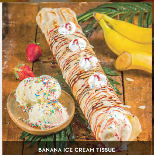
BANANA ICE CREAM TISSUE

SPECIALTY PRATA, MURTABAK & DESSERT PRATA WILL BE AVAILABLE FROM 4PM ONWARDS.