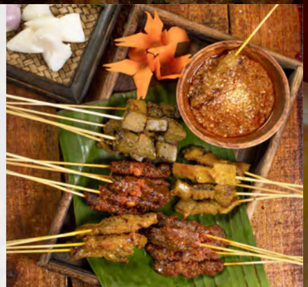
CHARCOAL GRILLED SATAY