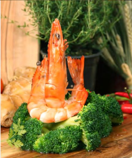
STIR FRIED BROCCOLI W TIGER PRAWNS