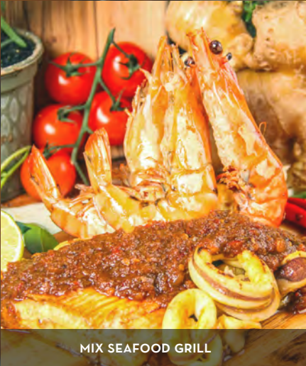
MIX SEAFOOD GRILL