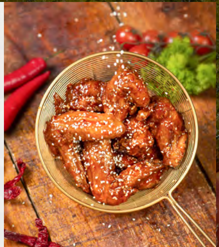
SRIRACHA & HONEY GLAZED CHICKEN WINGS