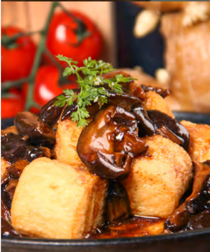
HOTPLATE EGG TOFU W FRESH MUSHROOMS