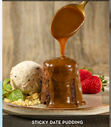
STICKY DATE PUDDING